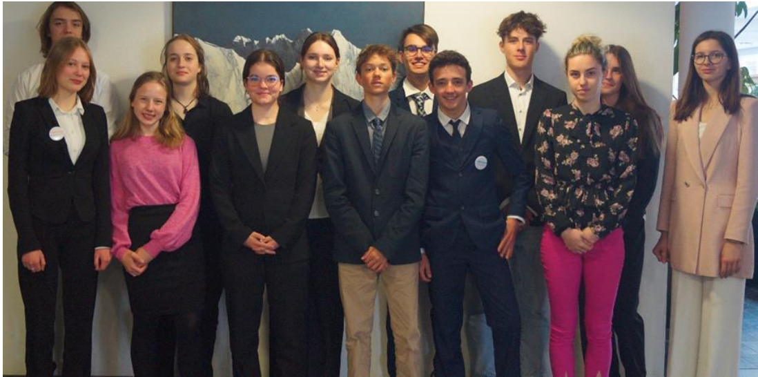
The press group 2023