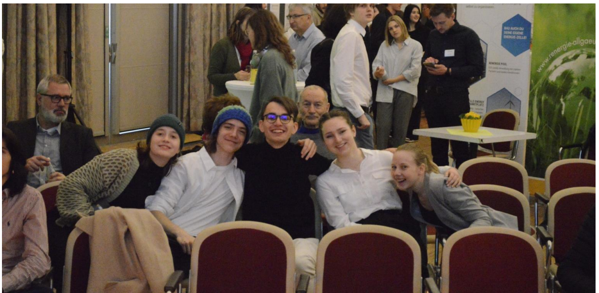
The Press Group while the Public Market